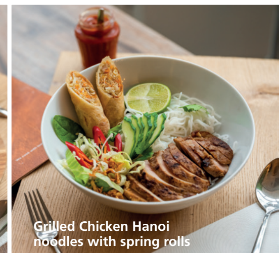
Grilled Chicken Hanoi noodles with spring rolls