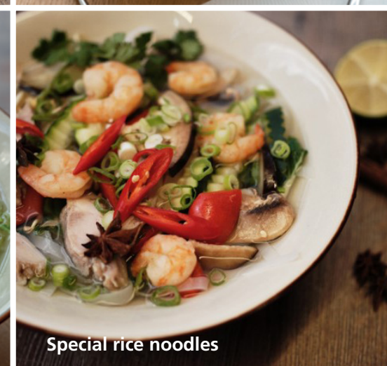
Special rice noodles