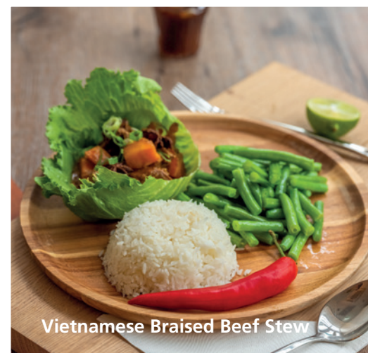
Vietnamese Braised Beef Stew